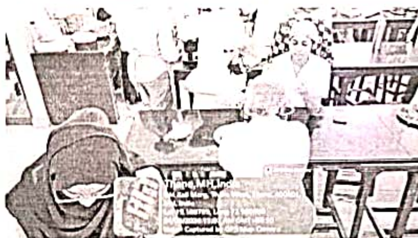
Students during practicals and Exam

Graphical Representation of Feedback: The overall feedback is excellent.