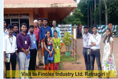
Visit to Finolex Industry Ltd. Ratnagiri