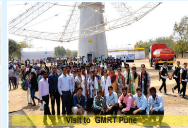
Visit to GMRT Pune