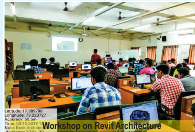
Workshop on Revit Architecture