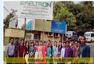
Industrial Visit to Keltron