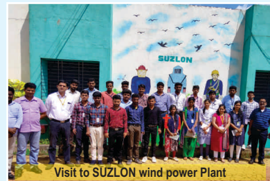
Visit to SUZLON wind power Plant