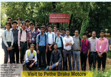
Visit to Pethe Brake Motors