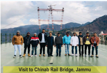
Visit to Chinab Rail Bridge, Jammu