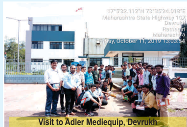
Visit to Adler Mediequip, Devruki