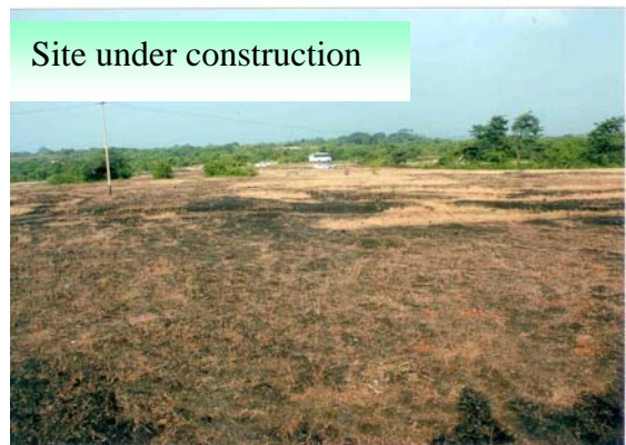
Site under construction

The Master plan of the said project includes starting AICTE recognized Engineering, Horticulture and Ancillary Courses, Hotel Management & Catering Courses, Architecture Colleges in the campus. The Mandal has decided to impart the education in the name of Lord Parshurama i.e. " VPM's Maharshi Parshuram College of Engineering ". Approximately 1,00,000 Sq. Mtr. built up area would be constructed. The educational complex will provide state of the art facilities containing 6 Educational Buildings, Canteens, 23 Hostel Buildings for Students, 5 Staff Quarter Buildings, for Principal's bungalow and an Amphitheatre. We expect that the actual commencement of Colleges will be from academic year 2012-13.